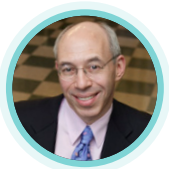
Prof. Clay Gillette ( New York University )

All in all, two elements are the most important. First, relationships between different levels of government as well as engagement with other stakeholders is vital, and perhaps even more important than formulating legislation. For the implementation of spatial plans, it is essential to engage with the local political economy. Secondly, fiscal sustainability forces us to reflect on the implementation process. It demands that we emphasize the importance of multidisciplinary teams, implementation as an iterative process, formal and informal capacity building, testing of scenarios, and learning from best practices.